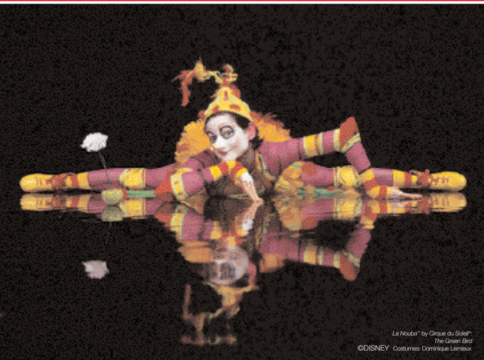
La Nouba™ by Cirque du Soleil™: The Green Bird Costumes: Dominique Lemieux

Marvel at the incredible stunts of the performers at La Nouba™ by Cirque du Soleil®.